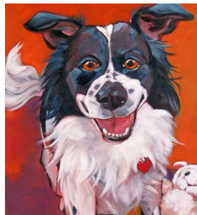
2010 Rescue Round Up Logo in need of your clever animal quips!

Still scratching your head about the Rescue Roundup? Check out the website at www.rescueroundup.net . So mark your calendars and get ready to promote what we do - save lives and have fun doing it!