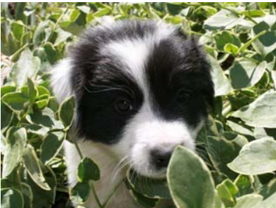
Below: Chex, an ABCR foster dog as a puppy