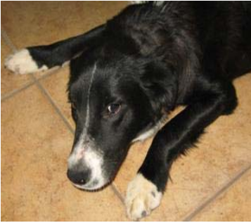
Above: Pete, an ABCR foster dog